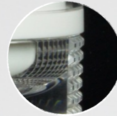
*Features: light refraction and tactile memory