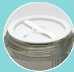
*Features: Spatula mounted on the dust cover.