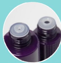
*2 sizes of stopper open is available. (ø 3/7mm)